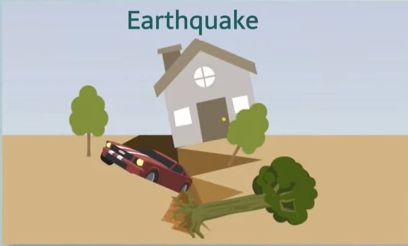
Short term Disaster