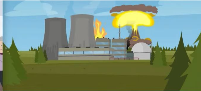
Atomic power plant failure